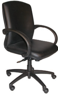
Model #1515 *Mid Back shown with # 5 arm

Knee-Tilt Control Standard Size High Back / Mid Back