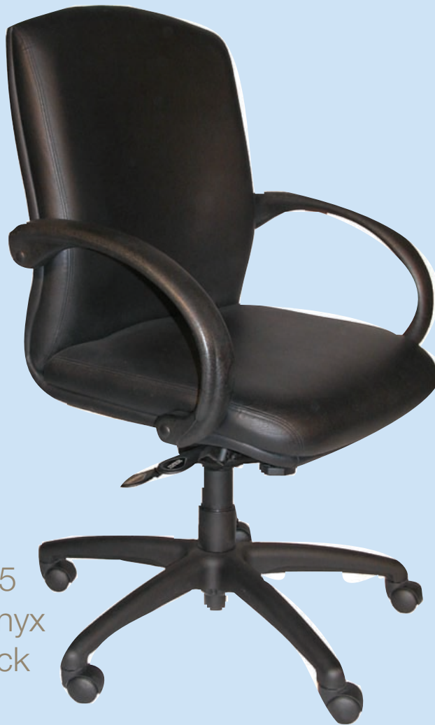
Model #1515 in Prague Onyx with Mid Back

The Horizon is a traditional executive styled chair, ideally suited for multi task use including conference and meeting room applications. The classic stitching on the seat and back add to the aesthetics of a chair whose ergonomic range is as impressive as its comfort.