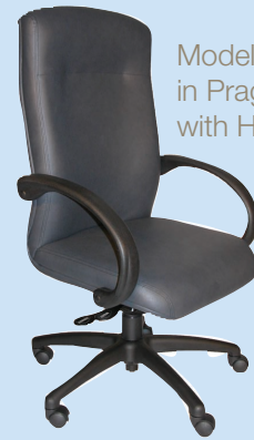
Model #1525 in Prague Gunmetal with High Back