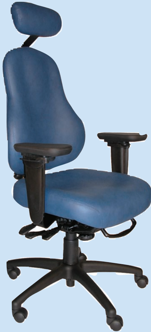
Model #4527-HR in Prague Blueberry with High Back and Headrest option

A proven favorite, the Marathon was designed to provide the ultimate contour fit with lumbar support, and extensive personal adjustments. Our flagship multi-task chair, the Marathon has been specifically engineered to support most users between the 5th and 95th percentiles.