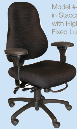
Model #4326 -FL in Staccato Black with High Back and Fixed Lumbar option