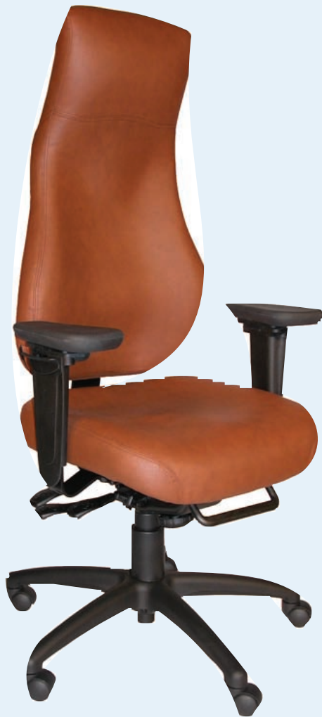
Model #5527 in Prague Brown

The Signature chair elegantly blends the features of an ergonomic task chair with executive styling, reinforcing the Built2Last™ ergonomic principals. Stitching detail on the seat and back compliment the executive styling all at an affordable price. The Signature chair comes equipped with an integrated neck roll support and air adjustable lumbar.